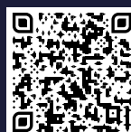
Discover our solutions